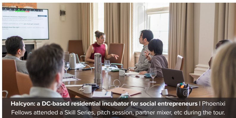
Halcyon: a DC-based residential incubator for social entrepreneurs | Phoenixi Fellows attended a Skill Series, pitch session, partner mixer, etc during the tour.