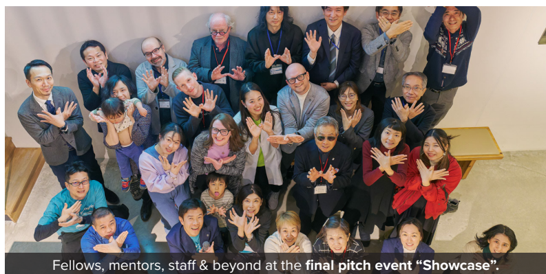
Fellows, mentors, staff & beyond at the final pitch event "Showcase".