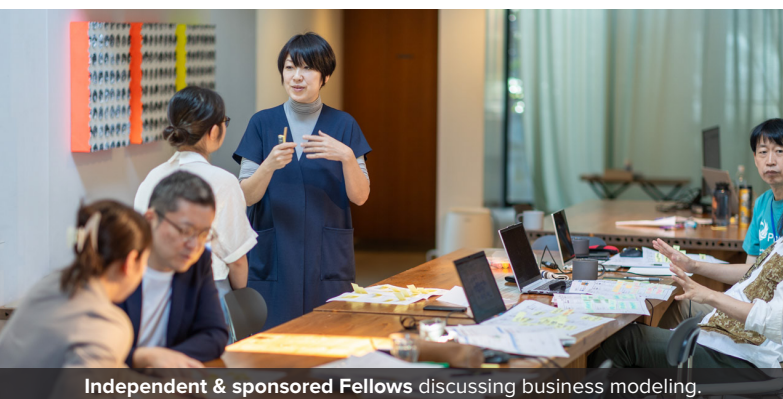
Independent & sponsored Fellows discussing business modeling.