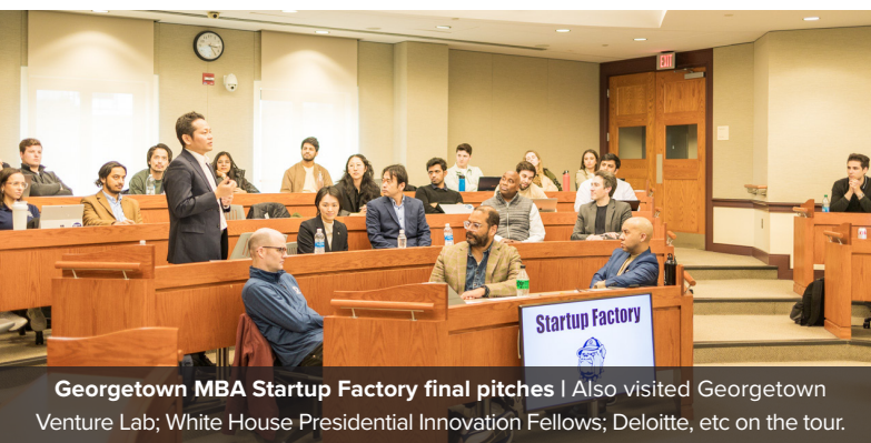
Georgetown MBA Startup Factory final pitches | Also visited Georgetown Venture Lab; White House Presidential Innovation Fellows; Deloitte, etc on the tour.

Halcyon+DC Tour for Phoenixi Fellows to take a glimpse into the US Capital startup ecosystem | 3 alumni visited 8 organizations driving impact businesses and attended 12 events over the course of 5 days (March 2024).