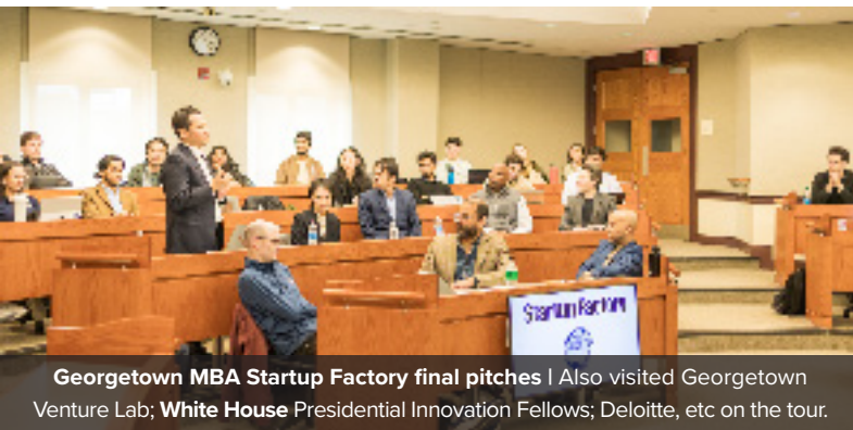
Georgetown MBA Startup Factory final pitches | Also visited Georgetown Venture Lab; White House Presidential Innovation Fellows; Deloitte, etc on the tour.

Halcyon+DC Tour for Phoenixi Fellows to take a glimpse into the US Capital startup ecosystem | 3 alumni visited 8 organizations driving impact businesses and attended 12 events over the course of 5 days (March 2024).