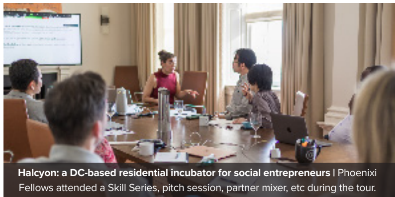
Halcyon: a DC-based residential incubator for social entrepreneurs | Phoenixi Fellows attended a Skill Series, pitch session, partner mixer, etc during the tour.

Interviews with Independent Fellows [Eng, Jpn]