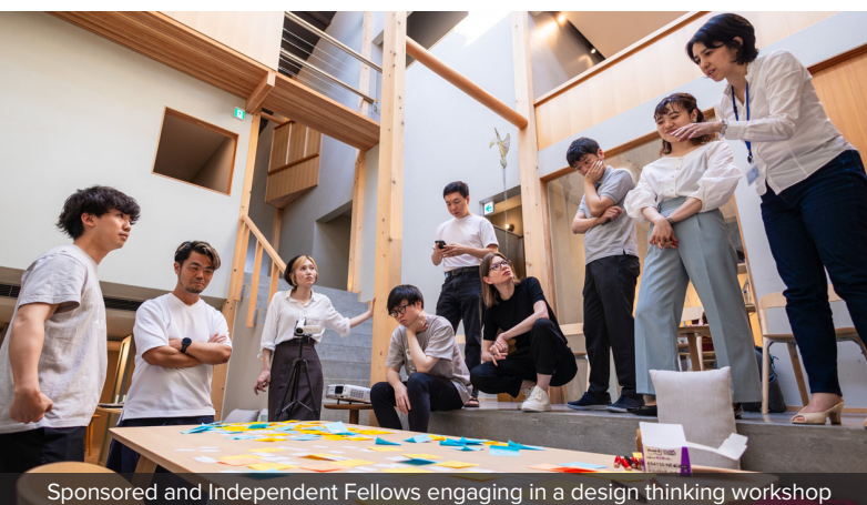
Sponsored and Independent Fellows engaging in a design thinking workshop

— a Kyoto University femtech startup Incorporated Flora (Dec 2020) » Launched flora app for pregnancy self-care (0.1M users); flora biz to enhance women's labor health (50 firms) » Raised 1M yen from toberu fund etc; Forged alliance w/ Toyota Tsusho (Dec 2023) » Named Forbes 30 Under 30 Asia 2024 , and more.